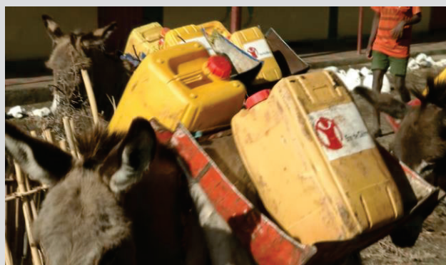
Water is being provided for 75 schools in Afar using donkeys

Save the Children has reached 119,614 people directly through its Education in Emergency programme during the two years of drought response. In 2016 alone more than 80,000 students, over 800 teachers and over 200 Parent Teacher Associations have been supported by our programmes. Major activities in 2016 were: school feeding for 57 schools of Afar and Somali regions benefitting a total of 12,780 children; water trucking in schools in 75 schools which is still undergoing in Afar, Somali and Amhara Regions with 285 donkeys and 5 water tankers; and education supplies and play kits distributed to 108 schools in Afar and Somali regions benefitting 19,202 children.