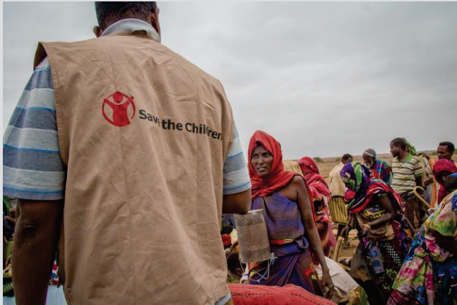
People from Denkarone and surrounding areas fill their containers with precious water delivered by Save the Children.