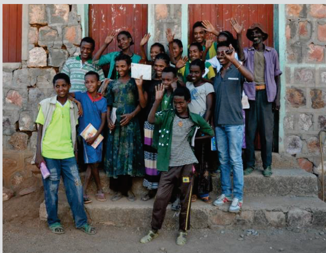
Members of school-led children's clubs in Sekota District, Amhara Region.

The challenges that remain for the sector and for Save the Children are the limited resources constraining the scale up of these successful programmes to over 200 other high priority districts identified. This includes a lack of operational partners, available and timely funding, and the capacities of specialised actors to train others to be able to effectively intervene in cases of early marriage, child labour, forced migration or other complex issues forced on communities by the extreme challenge of surviving one of nature's worst disasters.