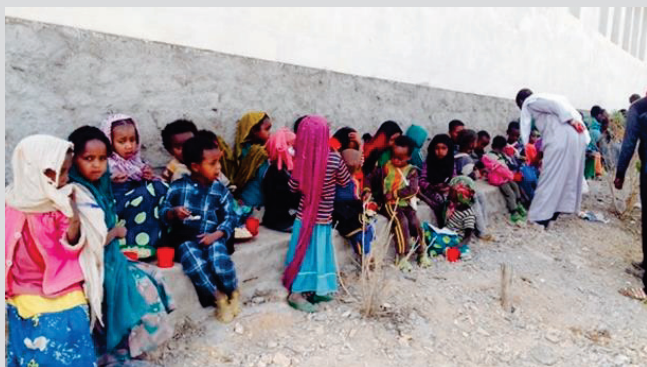
Children at Sasato primary school in Afar region. Save the Children provides school feeding for 36 schools in the region.

Our Education sector response focuses on increasing access to education for all ages, by first ensuring all school children and teachers have access to water for drinking and essential hygiene, improving school and district management to ensure teachers are in place and teaching, and increasing community engagement to ensure children are learning.