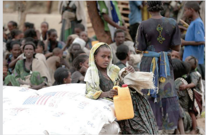
Food aid in Ziquala Woreda Waghimira Zone, Amhara Region being delivered by Save the Children.